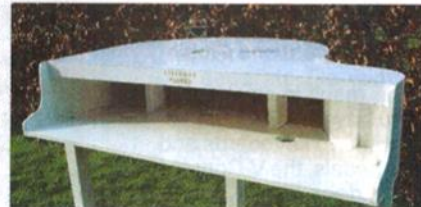
A Steveway Piano Shell

I have recently become aware of a new firm called Steveway Pianos, who make piano shells, cases into which you can place the keyboard of your digital piano so that it looks smart. Pretty much any make of digital piano keyboard will fit in the opening provided. I can see a huge use for these for touring stage shows, where you want the grand or baby grand piano look on stage but it isn't practical to tour an acoustic instrument, and the good news is they aren't too heavy (20kg) but look lovely. I'm sure some people will also choose them for home use.