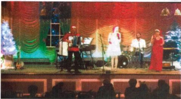
The Llay Organ Society Christmas Show 2016